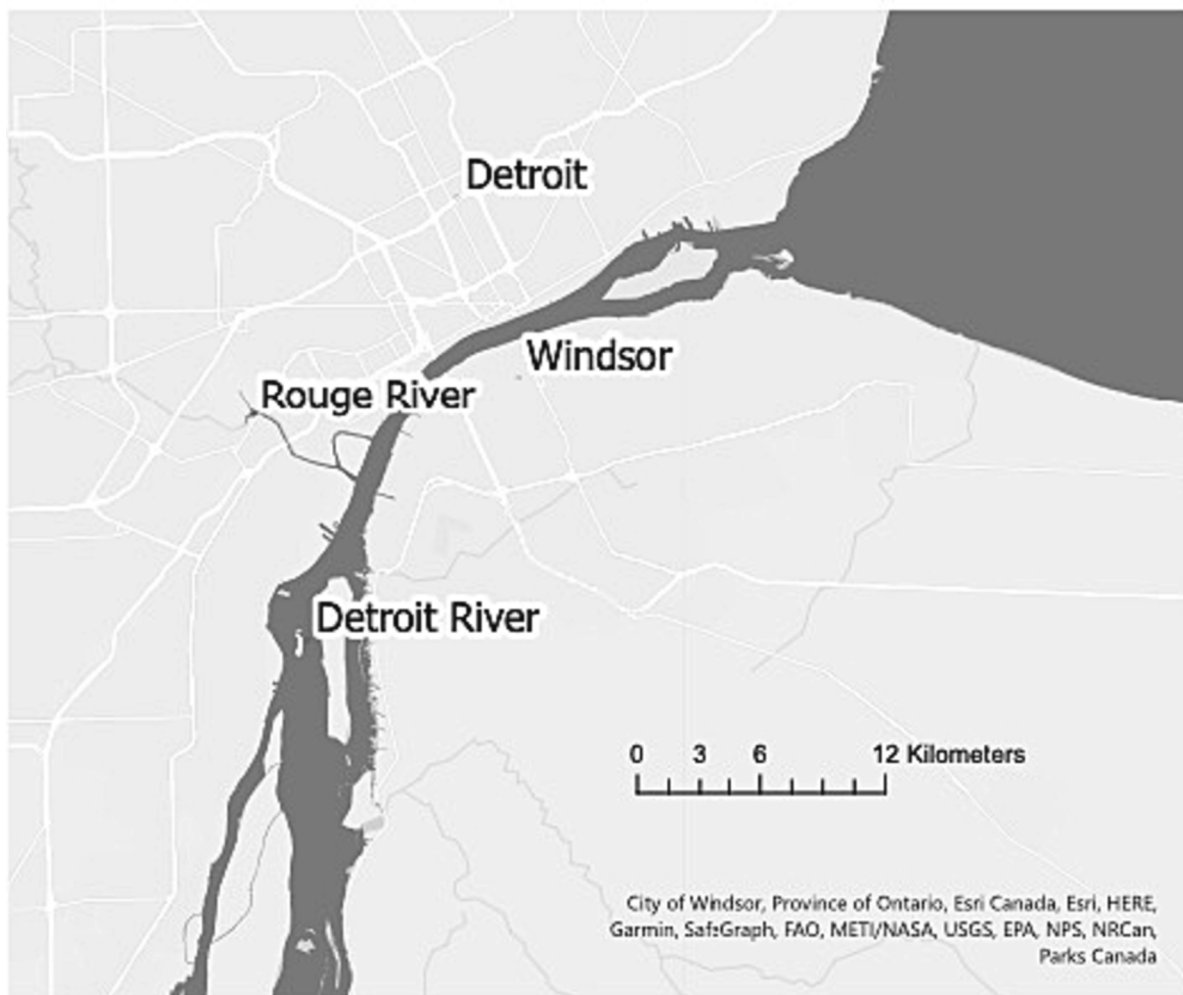
Fig. 1. Map depicting the Detroit and Rouge Rivers.

The SOS is a Canada-U.S. forum held every two years that brings together natural resource managers, researchers, students, business representatives, members of environmental and conservation organizations, and concerned citizens to assess ecosystem status and provide advice to improve research, monitoring, and management programs for the Detroit River and western Lake Erie. The Conference now has a 25-year history of documenting and supporting transboundary cooperation to better inform ecosystem-based management of these shared waterways. Reports and publications from these conferences are archived online at https://scholar.uwindsor.ca/softs/ . The theme of the 2022 conference was contaminated sediment remediation in the Detroit and Rouge Rivers. This theme emerged from the previous conference and